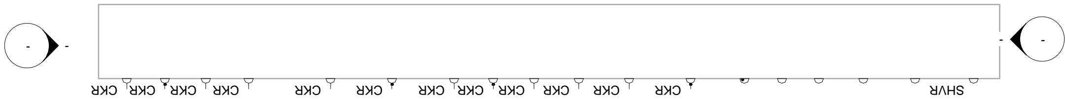
3 0 - Power 1 : 10